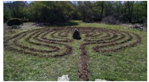
Labyrinth in the Ecology Center

Map, right, shows the complete trail system. The short "extension" at the top of the map is the part of the trail that has been flagged.